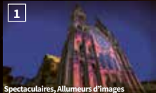
1 Spectaculaires, Allumeurs d'images