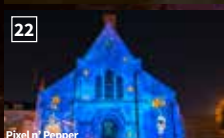
22 Pixel et Pepper